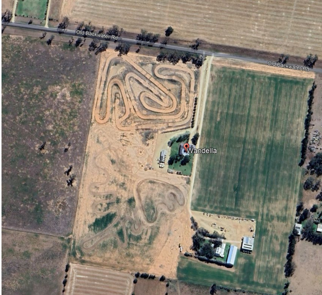
Figure 2: Aerial view of site (from Google Earth imagery dated 27 Sept 2023)