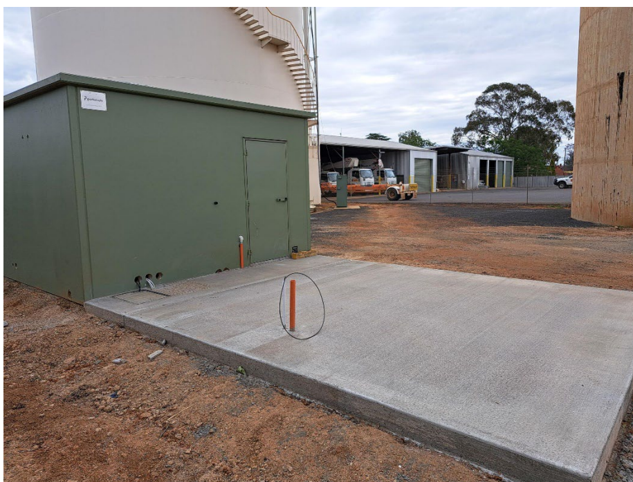
Figure 1: The northern water booster pump station is nearing completion

The team has been busy finalising the northern booster pump station to provide higher pressure water to the northern side of Narromine. The booster station will be completed in the next month and will help to maintain and balance water supply to customers even during peak demand periods. All pipework is now connected, with only the electrical connection and generator to be installed.