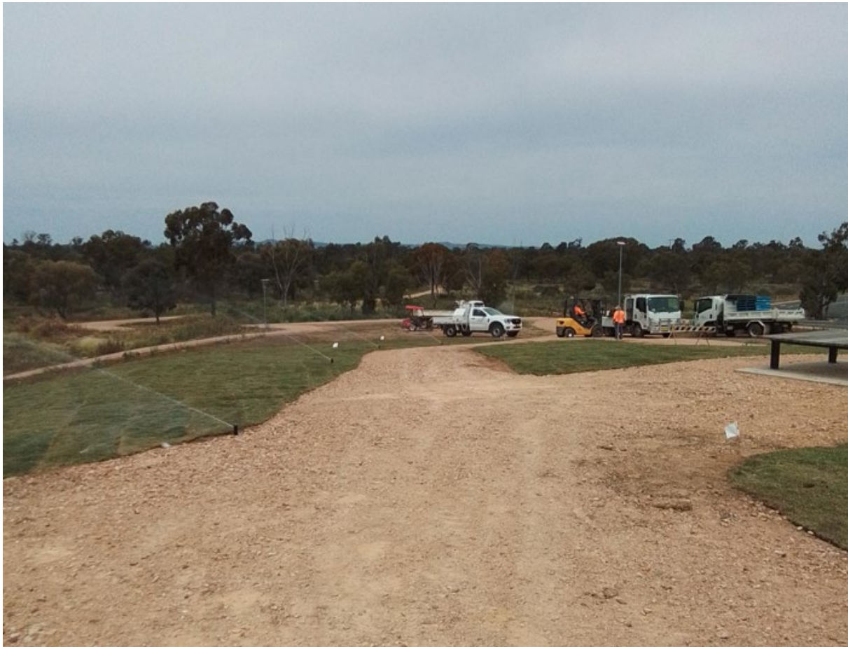
Figure 4: Lawn has been installed at the Wetlands viewing platform

Turf installation has been successfully completed at the Narromine Wetlands, specifically on the main BBQ viewing platform, by Council's Parks and Gardens team. This final enhancement makes the area a welcoming spot for barbecues or a tranquil place to enjoy the beautiful wetlands. The new lawn is supported by a subsurface irrigation system, ensuring it remains lush and inviting for community members to gather and appreciate the natural surroundings.