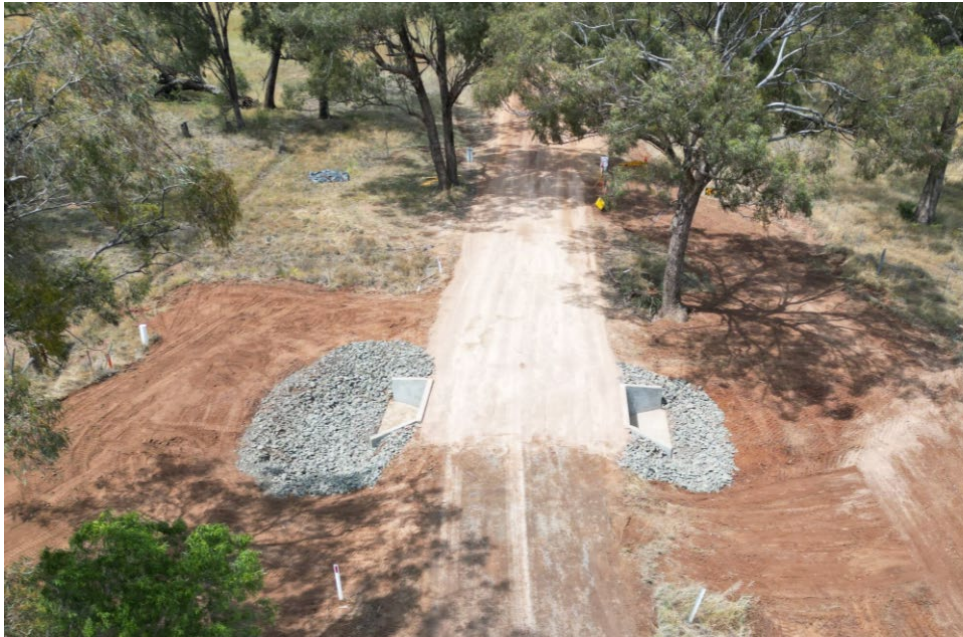
Figure 10: An old stock grid was replaced on Euromedah road with a large culvert

Works are continuing on Momo Road where a new culvert is being installed at the bottom of the deep creek. The new culvert should ensure the creek is passable in up to a one-in-twenty year flood event and remains in good condition after larger flood events. The works are expected to be complete by the end of November. The works are funded from a Local Government Grant as part of the Flood Funding resilience works.