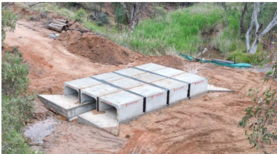
Figure 11: The construction of a culvert network on Momo Road is progressing

Works are continuing on Momo Road where a new culvert is being installed at the bottom of the deep creek. The new culvert should ensure the creek is passable in up to a one-in-twenty year flood event and remains in good condition after larger flood events. The works are expected to be complete by the end of November. The works are funded from a Local Government Grant as part of the Flood Funding resilience works.