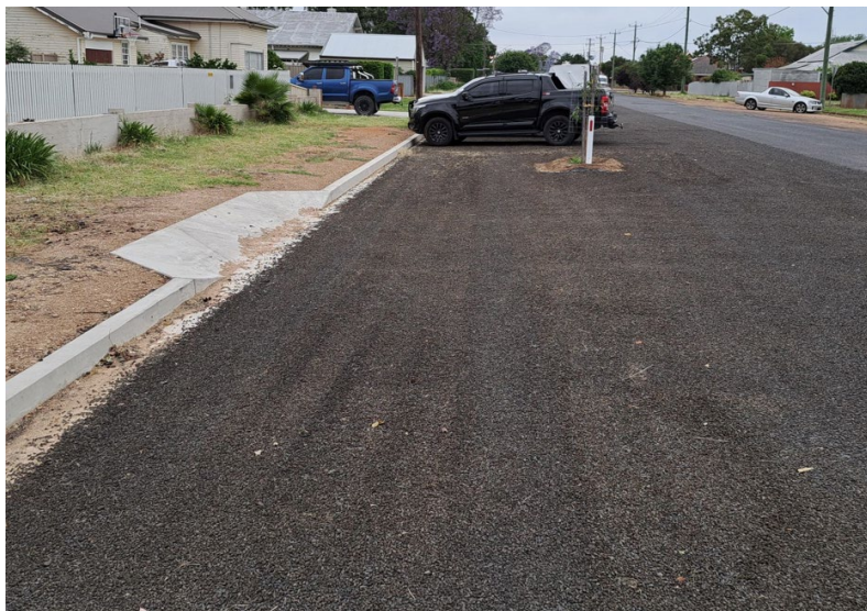
Figure 7: The kerb and gutter work in Fourth Avenue was sealed in October

The kerb and gutter project on Fourth Avenue is now complete with the final seal applied in October. The seal was delayed to allow the new works to thorough dry out, ensuring a solid and reliable base that will enhance the longevity and durability of the road for years to come.