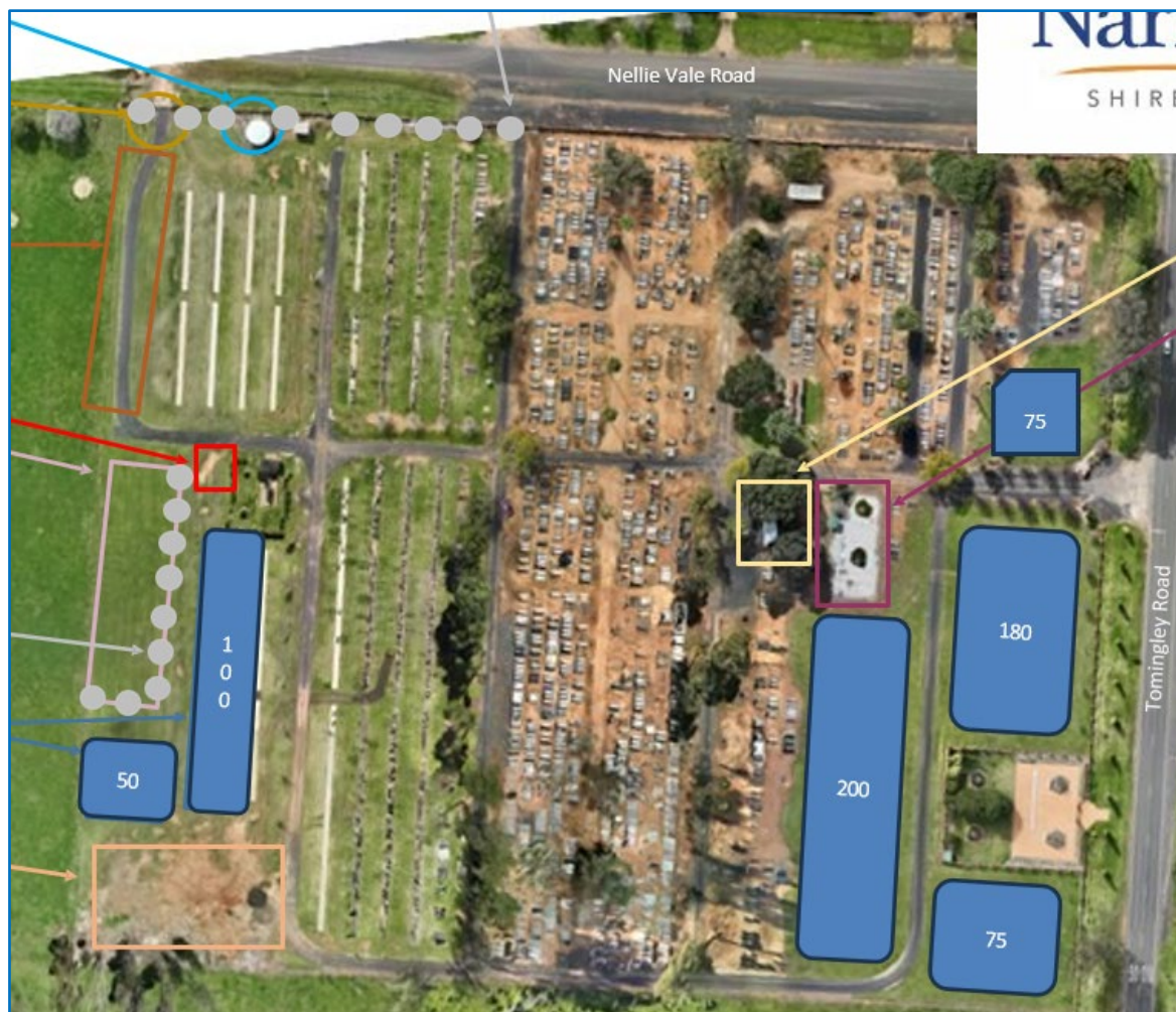
Figure 1: Estimated headstone spaces available after development

In total, after expansion, there will be space for 1,418 plots. Based on a conservative estimate of 36 burials per year, the cemetery is projected to have an estimated remaining life of up to forty years. Council should review this data in ten years to ensure its accuracy and consider plans for acquiring nearby land as necessary.