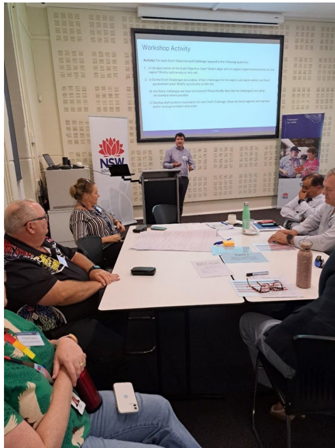
Figure 6: Mayor Ewen Jones and Transport for NSW Representatives at the recent strategic planning workshop

The kerb and gutter project on Fourth Avenue is now complete with the final seal applied in October. The seal was delayed to allow the new works to thorough dry out, ensuring a solid and reliable base that will enhance the longevity and durability of the road for years to come.