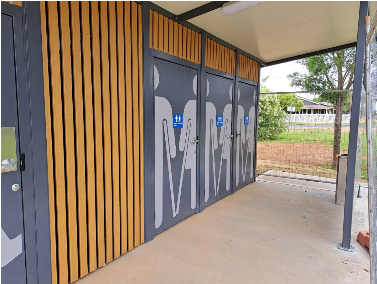
Figure 5: The new toilets at Dundas Park are complete and ready for use!

Signage will be placed on the old toilets to direct traffic to the new toilets. At the completion of the Northern Drainage project, a car park will be sealed at the entrance to Dundas Park, next to the newly constructed toilets to provide a safe and aesthetically pleasing stopping area for travelling and local visitors.