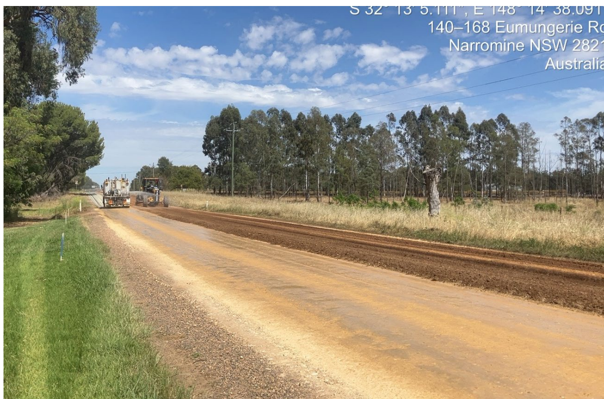
Figure 8: Heavy Patching on Eumungerie Road

Heavy patching on Eumungerie Road was undertaken by a contractor in late October with over 7,000m 2 being heavy patched. The sealing works started in early November with over 60,000m 2 due for sealing. These much-needed repairs will help improve the road condition for all vehicles, however, full rehabilitation of the road is needed and Council continues to work with the State Government to find funding opportunities.