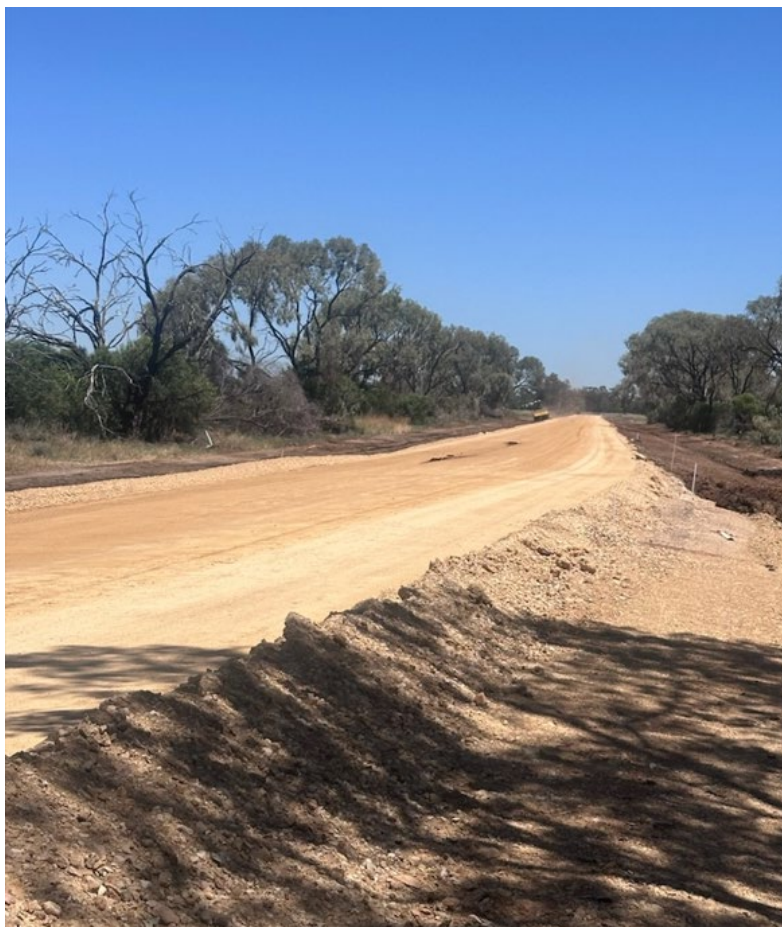
Figure 9: Road Upgrades on Enmore Road are continuing

Maintenance works have been completed on the following roads: