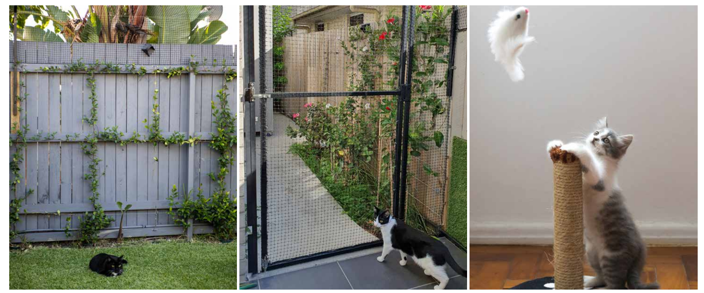
Figures 2 and 3: Cat proof fencing. Figure 4: Cats can live safe and content lives indoors, provided appropriate enrichment is provided.

Desexing (sterilisation) is the most important action pet cat owners can take to prevent unwanted litters and unnecessary euthanasia. Desexing involves surgical removal of the ovaries and uterus of female cats, and testicles of male cats, and is the only widely available, effective and permanent way of preventing unwanted breeding<sup>10</sup>.