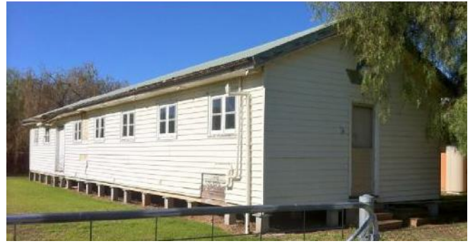
BELOW: The former Narromine Aero Club Building

ABOVE: RAAF Narromine (Approximately 1940)